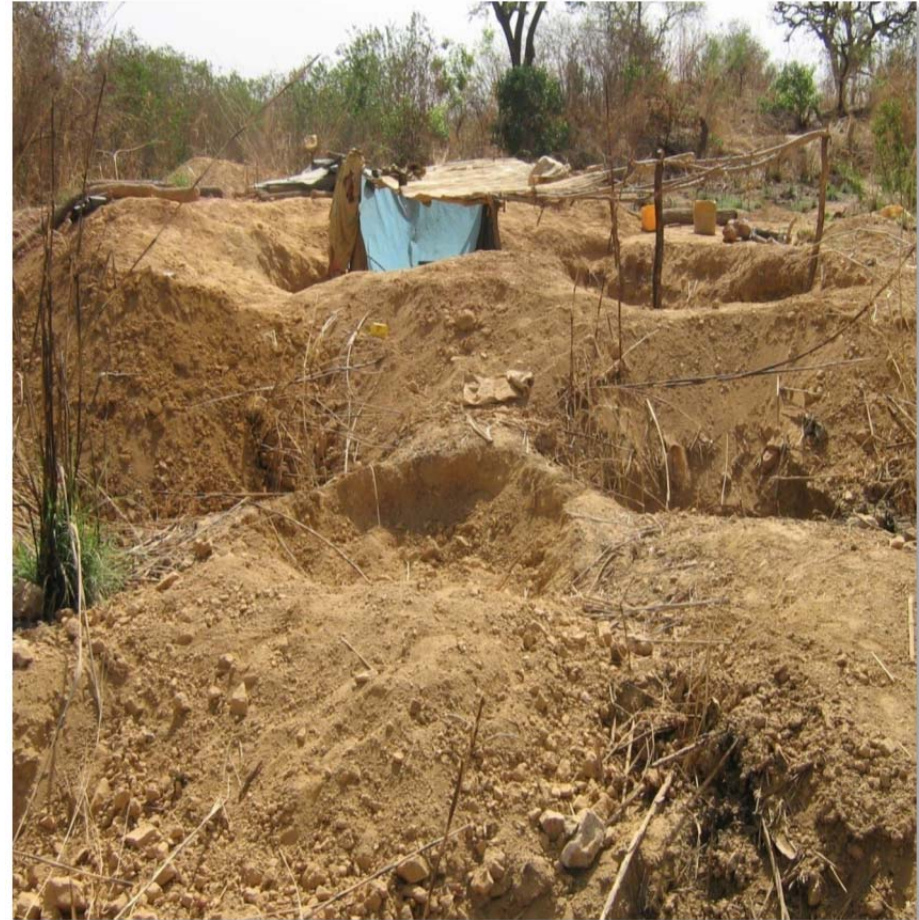
Plate 2 – Extensive Artisanal Gold Mining Workings in Prospective Areas