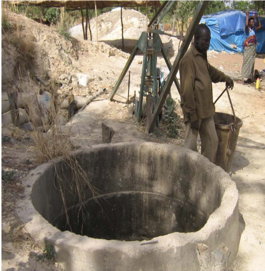
Plate 1 – Artisanal Gold Mining Infrastructure Established to Depths of 40m