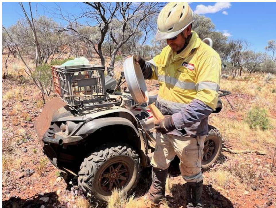
Photo 2 - Soil Geochemistry Sample Collection at the Cosmo Gold Project (7 October 2024)